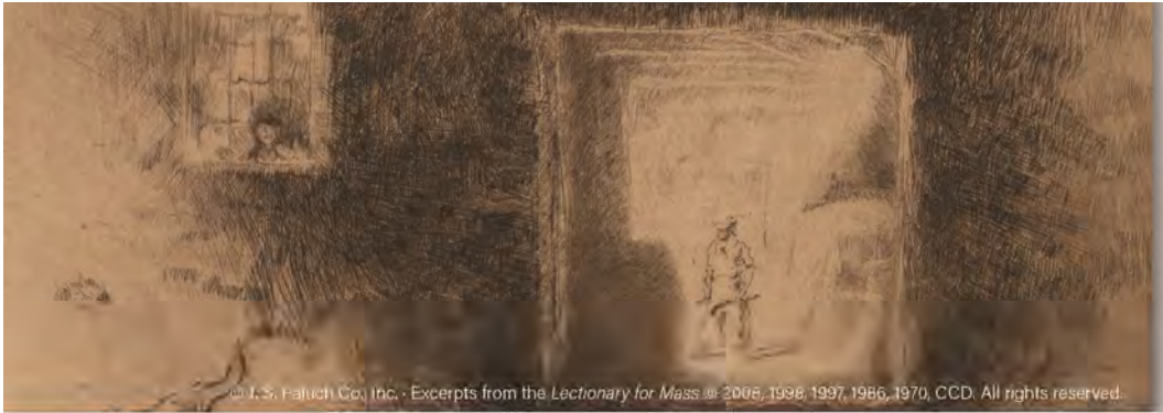
Nocturne: Furnace 1879/80 James McNeill Whistler American, 1834–1903 Art Institute of Chicago