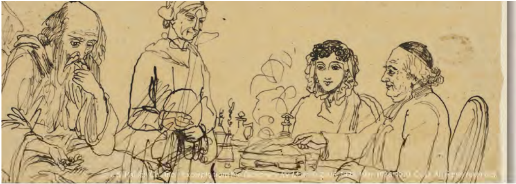
Alms to the Poor n.d. Rodolphe Bresdin French, 1825–1885 Art Institute of Chicago