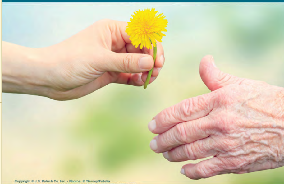
Copyright © J.S. Palach Co. Inc. Excerpts from the Lectionary for Mass © 2001, 1998, 1997, 1986, 1970, CCD.

Give, and gifts will be given to you; a good measure, packed together, shaken down, and overflowing, will be poured into your lap.