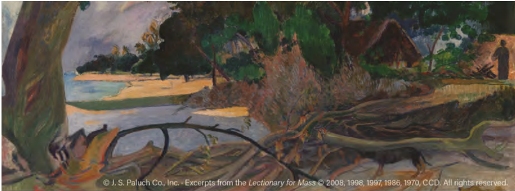
Te burao (The Hibiscus Tree)

1892 Paul Gauguin French, 1848–1903 Art Institute of Chicago