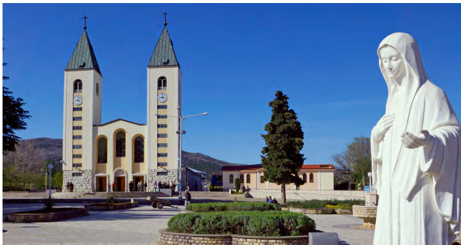
Church of St. James - Medjugorje