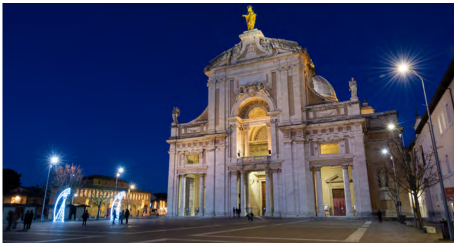
St. Mary of the Angels Basilica - Assisi